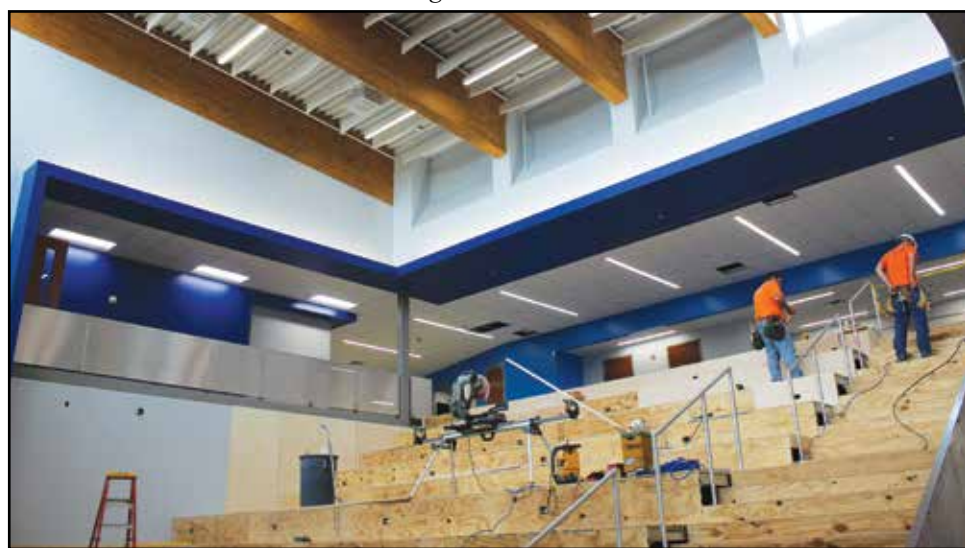
Middle/High School Collaboration Stairs