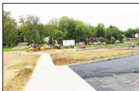
Lake Elementary New Sidewalks