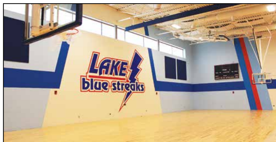
Lake Elementary Gym