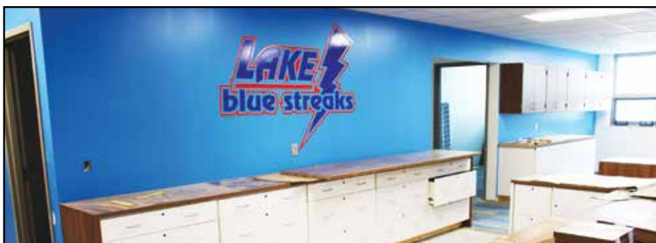
Lake Elementary Administrative Office