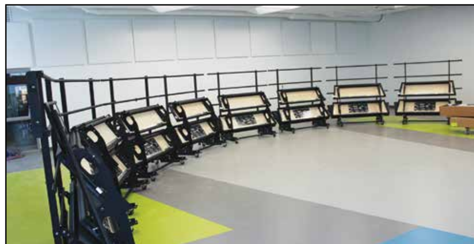
Lake Elementary Choir Room