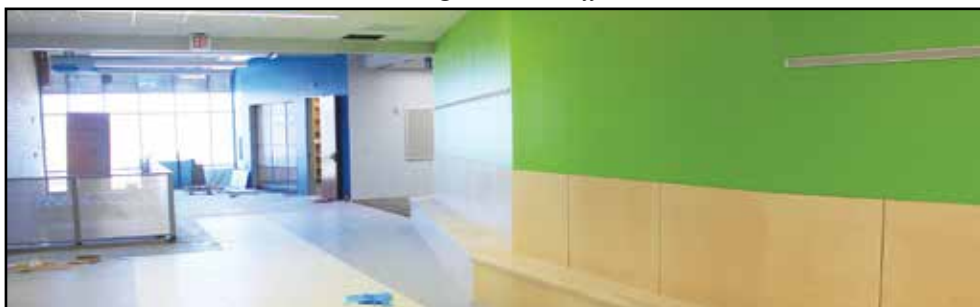
Middle/High School Upstair Hallway