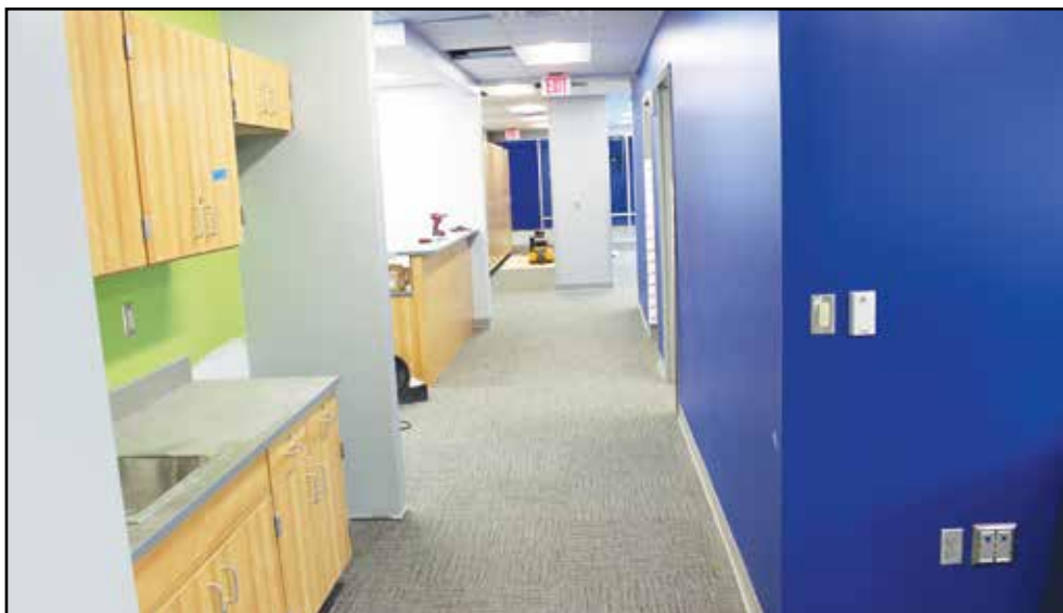
Middle/High School Staff Area