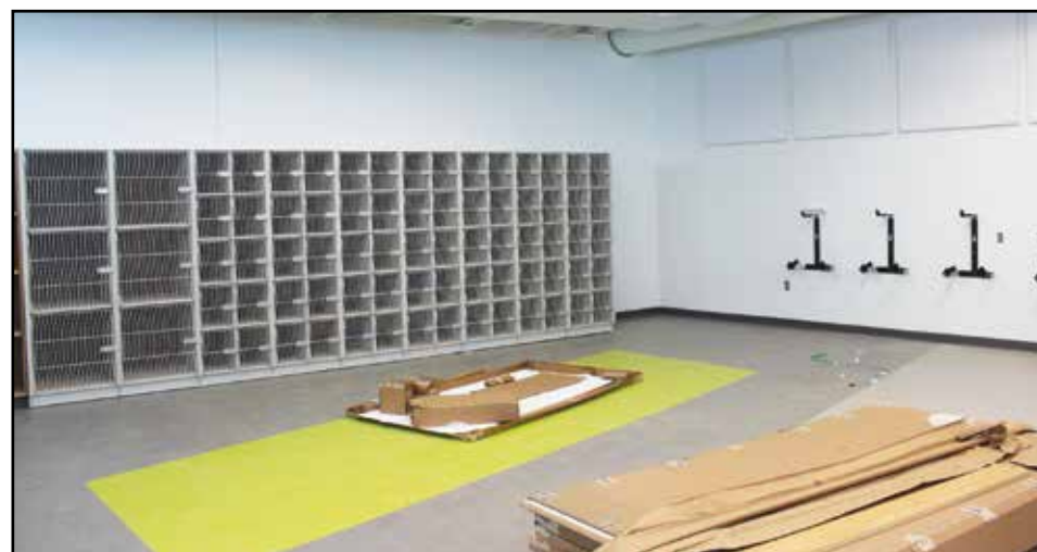
Lake Elementary Band Room