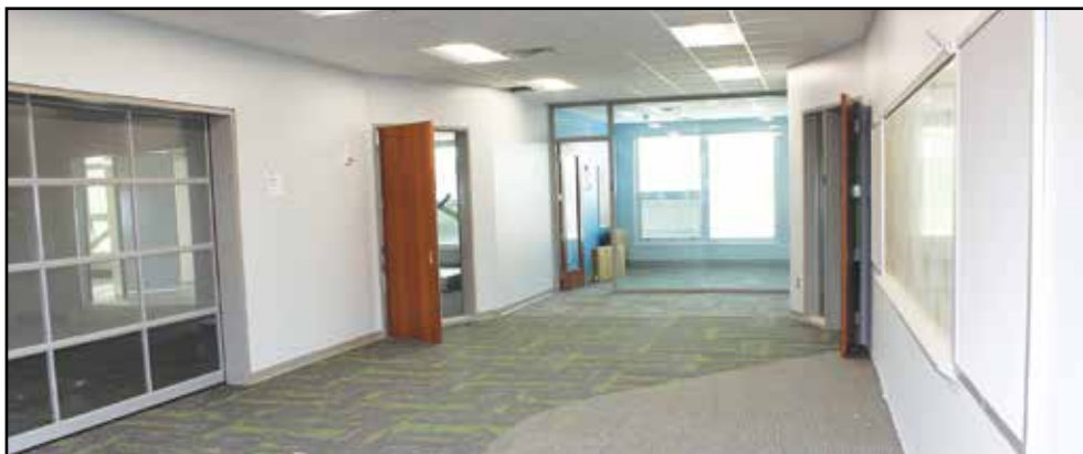
Middle/High School Hallway