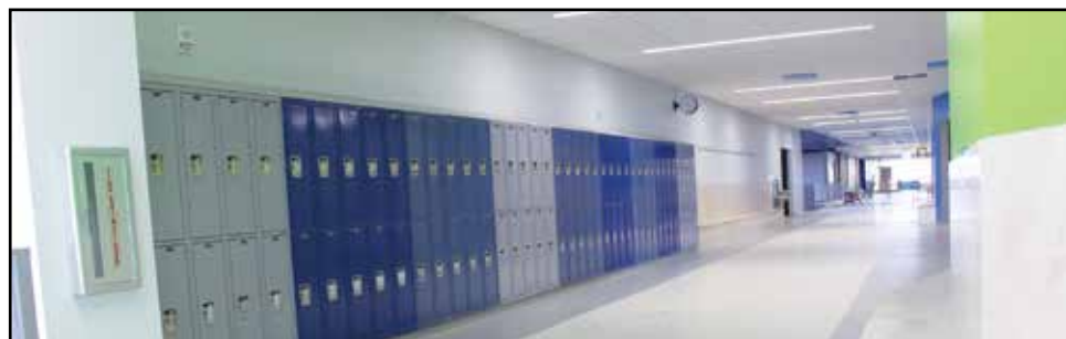
Middle/High School Upstairs Hallway and Lockers