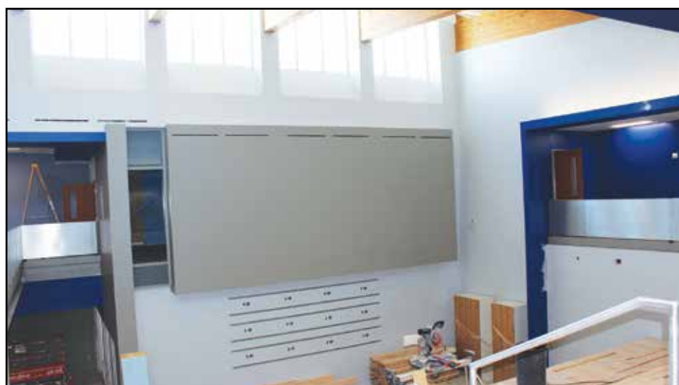
Middle/High School Screen over Collaboration Stairs