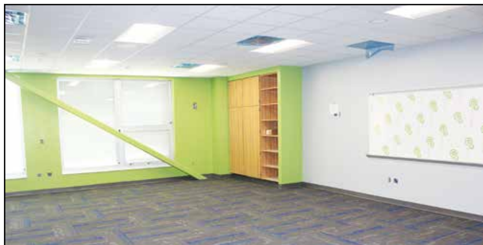
Middle/High School Classroom

Additional phases of work will commence this summer on existing portions of the building. This includes the segregation and demolition of the 200/300/400 classroom wing. This will make way for a new gymnasium, science classrooms, new main entry and two-story connection corridor. This phase of work will take the course of a year to complete. There will also be significant renovations of the art and music wing in the existing high school. After significant coordination and planning efforts, construction crews are ready to begin work on an intense, 15-week renovation schedule to be completed by the end of the summer.