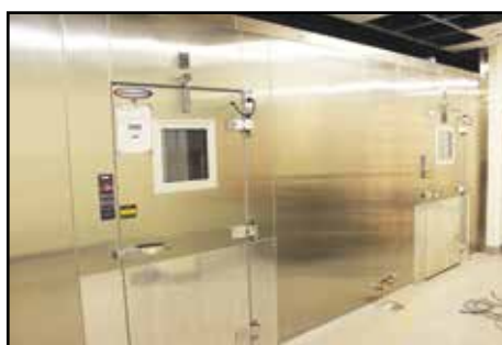
Lake Elementary Kitchen Walk-In Cooler